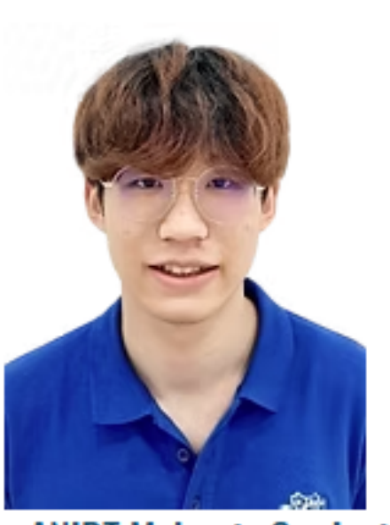
ANIBT Malaysia Graduate 6-month Foundation, Malaysia

Curtin University, Australia Diploma of Commerce (9 months) Bachelor of Business Administration (2 Years)