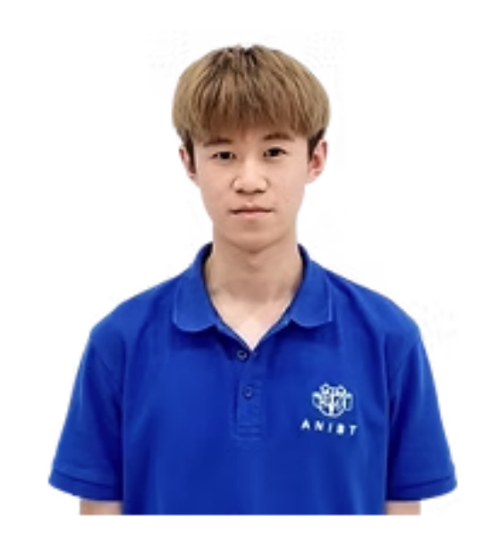
ANIBT Malaysia Graduate 6-month Foundation, Malaysia