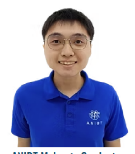
ANIBT Malaysia Graduate 6-month Foundation, Malaysia