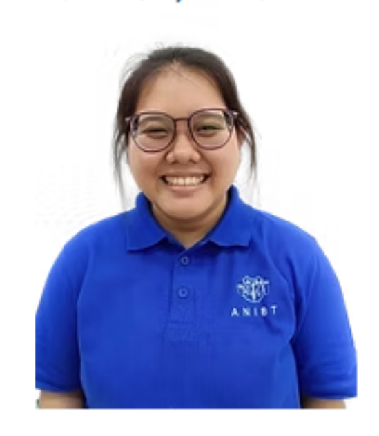
ANIBT Malaysia Graduate 6-month Foundation, Malaysia