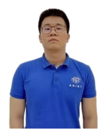
ANIBT Malaysia Graduate 6-month Foundation, Malaysia