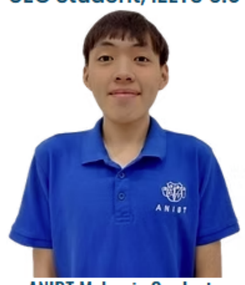
ANIBT Malaysia Graduate 6-month Foundation, Malaysia