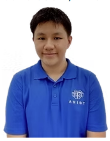
ANIBT Malaysia Graduate (Graduated at 16 y.o.) 6-month Foundation, Malaysia