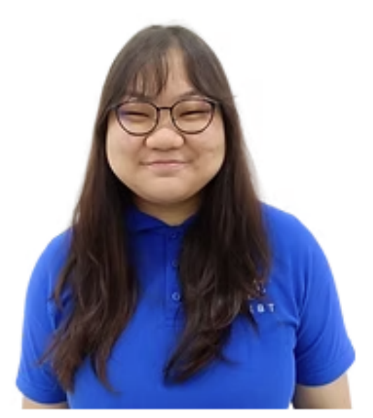
ANIBT Malaysia Graduate 6-month Foundation, Malaysia

Monash University, Australia Diploma of Arts (1.5 Years) Bachelor of Arts (2 Years)