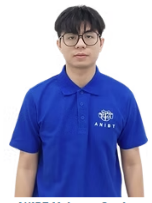
ANIBT Malaysia Graduate 6-month Foundation, Malaysia