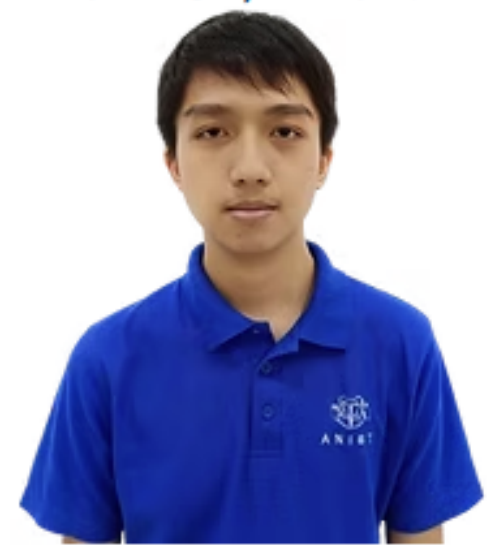
ANIBT Malaysia Graduate 6-month Foundation, Malaysia

Boxhill Institute, Australia Bachelor of Information Technology (3 Years)