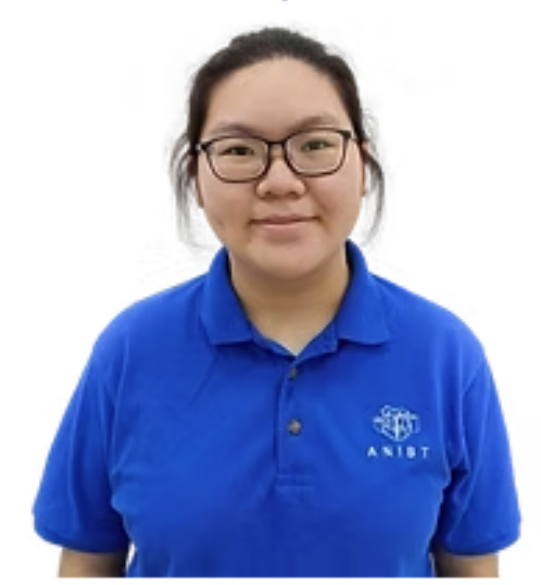
ANIBT Malaysia Graduate 6-months Foundation, Malaysia