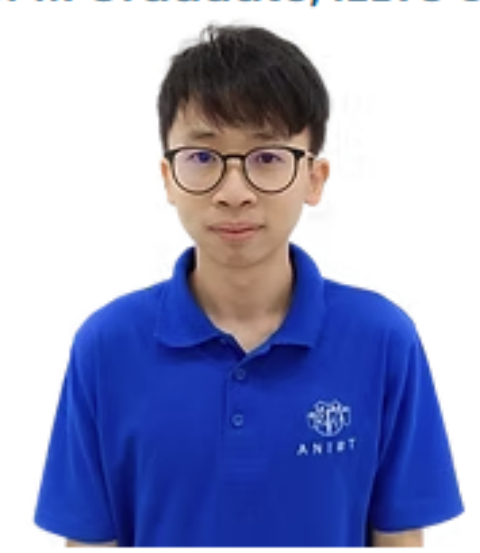
ANIBT Malaysia Graduate 6-month Foundation, Malaysia