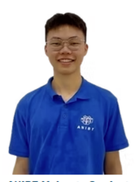
ANIBT Malaysia Graduate 6-month Foundation, Malaysia