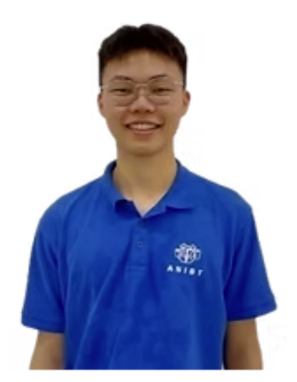
ANIBT Malaysia Graduate 6-month Foundation, Malaysia